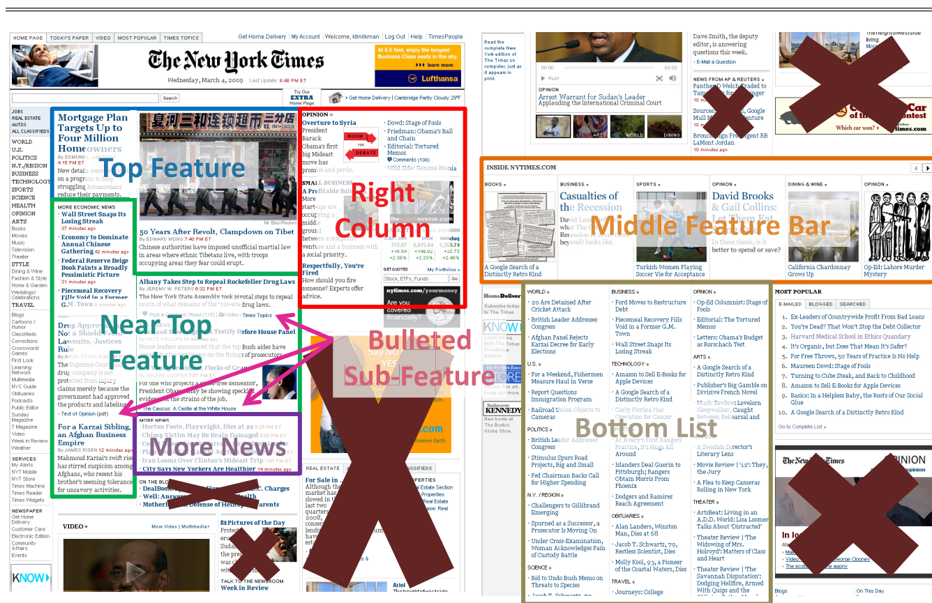
Figure 1 HOME PAGE LOCATION CLASSIFICATIONS

Notes: Portions with "X" through them always featured Associated Press and Reuters news stories, videos, blogs, or advertisements rather than articles by New York Times reporters.